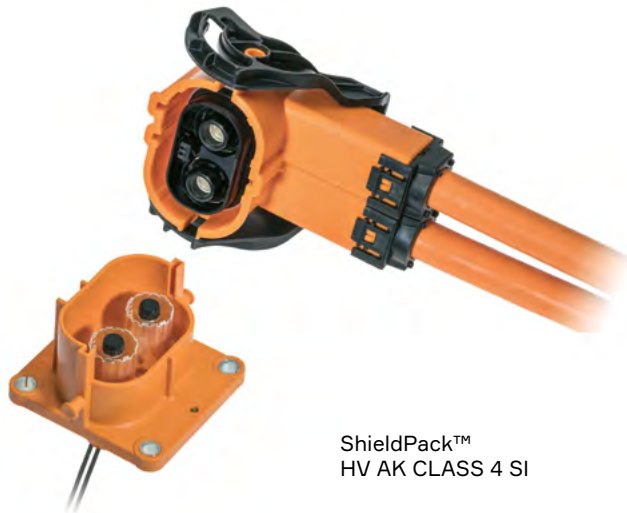
ShieldPack™ HV AK CLASS 4 SI