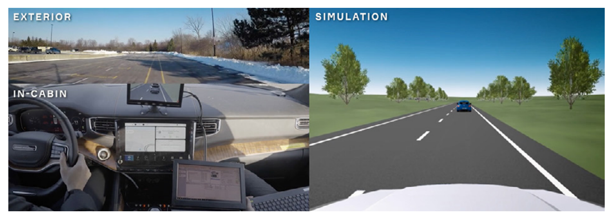
Vehicle-in-the-loop: In VIL, simulated inputs are fed to real hardware in a full vehicle.

Using VIL, OEMs can safely evaluate safety-critical software, such as ADAS and automated driving features, on vehicles already on the road. This is done by updating the software over the air but temporarily preventing the new code from controlling actuators. The updated software can then process inputs from sensors in real-world situations, helping developers refine its responses. This method also lets OEMs refine other features, such as infotainment options, by analyzing how drivers and passengers use them. Some OEMs plan to use postproduction VIL testing on models coming in the middle of this decade.