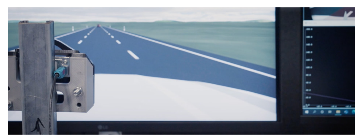
Hardware-in-the-loop: A HIL bench presents simulated inputs to real hardware.